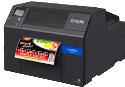
CW-C6500A 8" Auto Cutter