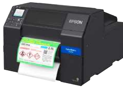
CW-C6500P 8" Peel-and-present