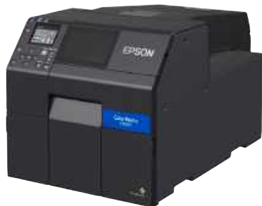
CW-C6000A 4" Auto Cutter

With a 4" or 8" built-in auto cutter covering the full spectrum of label sizes to create variable-length labels and enable easy job separation, these new ColorWorks models offer cost and inventory reductions compared to using pre-printed labels.