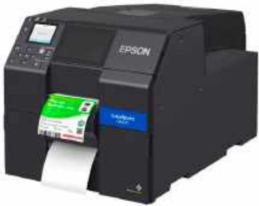
CW-C6000P 4" Peel-and-present

Epson offers the first color inkjet printer with peel-and-present capability, which can help speed up the manual application of on-demand labels. An integrated label-taking sensor holds off subsequent printing until the previous label is removed. This feature is ideally suited for fully automated label application systems. This unique capability eliminates the need for a loose loop and allows individual labels to be taken as soon as they are printed.