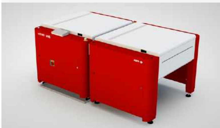
Attiro VHS clean-out unit, groundbreaking cascade concept for violet chemistry-free