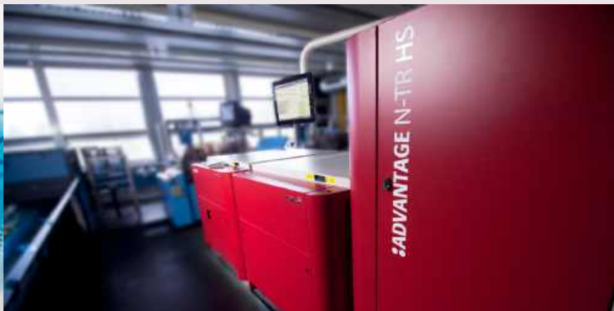
High-volume plate production system Advantage N-TR HS complete with on-line Attiro VHS COU.